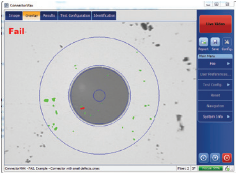
Defective connector failing acceptance criteria.