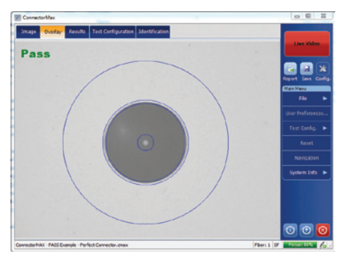
Connector free of any defect.