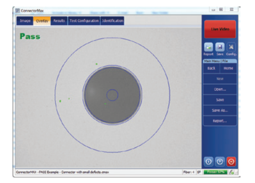
Imperfect connector still meeting acceptance criteria.

ConnectorMax therefore helps avoid two time- and money-consuming situations: undetected connector defects that force technicians to later return to the site, and unnecessary replacement of connectors whose slight defects are not enough to get a "fail" verdict.